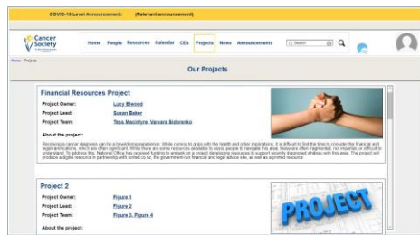
Prototype design of Project Page