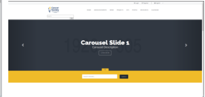
Home Page for the Website