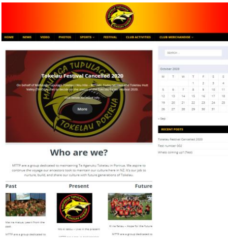
Web Application - Home